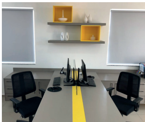
Office Rios 1 | Sorocaba SP