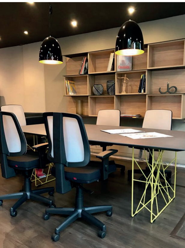
JB Home & Office | Uruguay

In modern spaces, only a multiuse line may offer comfort and promptness solutions in a wide range of uses. Cavaletti Flip has been designed to meet various working situations, dialogue and meetings with the best cost-benefit ratio in its class. Check some photos of its presentation in showrooms in Brazil and abroad.