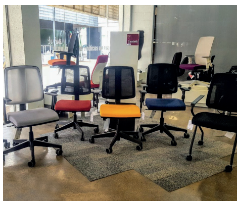
Tradesign | Porto Alegre RS