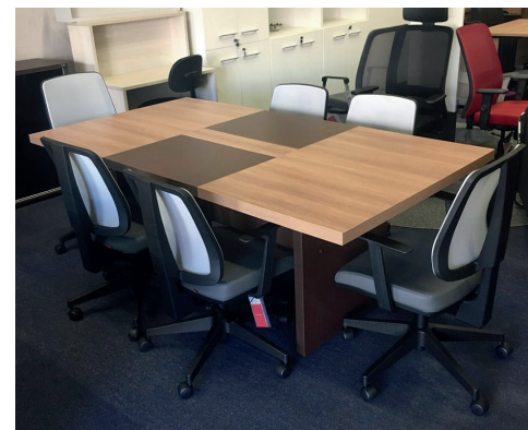
Workshop | Porto Alegre RS