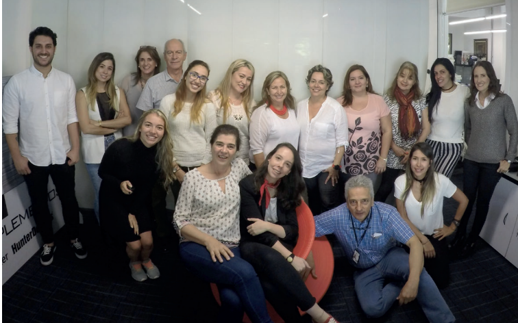
Elementos y Complementos Team