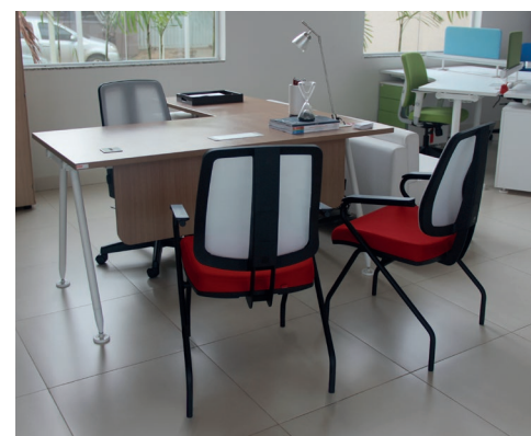
Use | Goiania GO