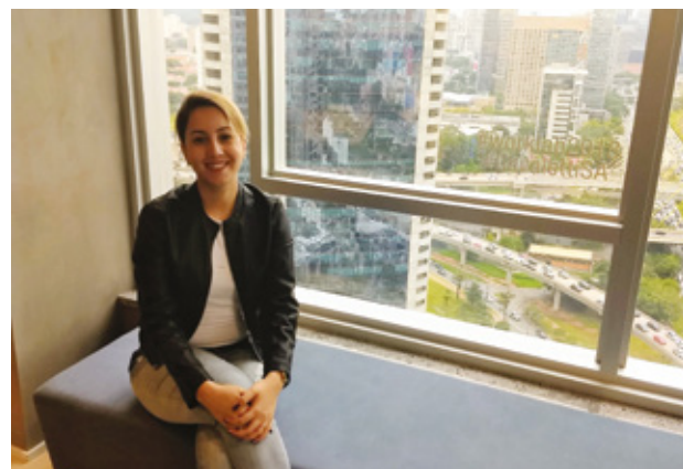
Drielly Dias Matriz Office – Office Solutions re-seller Goiânia/GO and Palmas/TO

“The Worklab experience was innovative and has changed our working environment concept. The proposal to show the office as inducing well-being and productivity shows how we can have other approaches to our clients and deliver more than a chair. Before Worklab, we also had the concept of integrated environments, but not with the particularities of each productivity mood, specific environments for each task to be performed and the best furniture option for each one of them.”